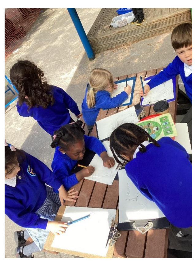
We learnt about the lifecycles of many different creatures, such as a duck, frog and caterpillar.