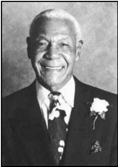
Buck O'Neil (1911-2006)

Download printables and colouring pages for your children, take quizzes, find activities, and read articles about the historic struggle for civil rights.